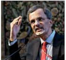
Despite GDP growth falling to a 15-month low, CEA V Anantha Nageswaran is positive

As far as the outlook is concerned, he said: "The growth momentum remains strong. The first quarter slowdown was anticipated due to the election and due to slowdown in government spending...there is healthy progress in monsoon, corporate and bank balance sheets are in good shape". The budget also provides a