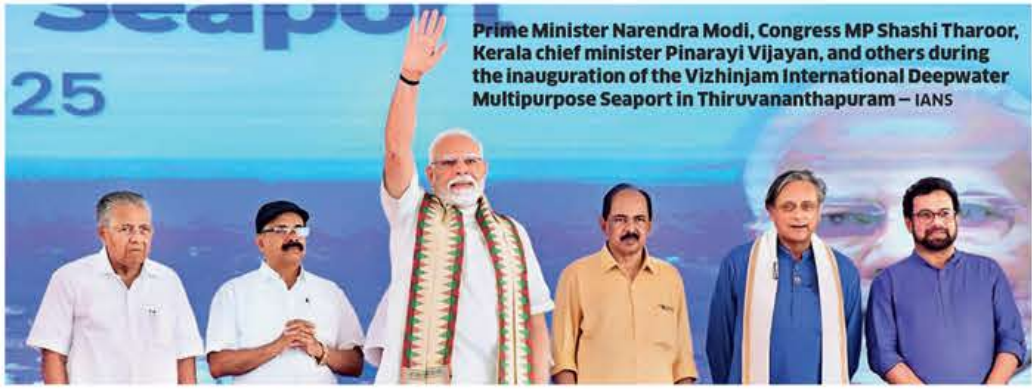
Prime Minister Narendra Modi, Congress MP Shashi Tharoor, Kerala chief minister Pinarayi Vijayan, and others during the inauguration of the Vizhinjam International Deepwater Multipurpose Seaport in Thiruvananthapuram

Says presence of Kerala CM and Tharoor at commissioning of Vizhinjam Seaport will give 'sleepless nights' to many