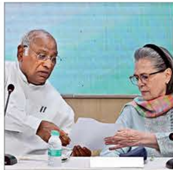
Congress president Mallikarjun Kharge and Cong Parliamentary Party chairperson Sonia Gandhi at the CWC meet in New Delhi

CWC resolution reiterated the party's solidarity with the families of the Pahalgam victims, questioned "Intelligence failure", sought "accountability", pledged the party's commitment to national unity and then demanded from the government "action". "This is a time for demonstrating our collective will as a nation to teach Pakistan a lesson and curb terrorism decisively. The masterminds and perpetrators of this cowardly attack must face the full consequences of their actions. The Congress party urges the Government of India to act with firmness, strategic clarity, and international coordination to isolate and penalise Pakistan for its continued export of terror into our territory". Party president Mallikarjun Kharge told the CWC: "While the Congress has extended full support